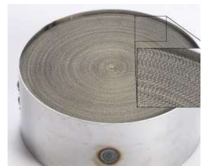
Metal diesel oxidation catalyst, produced and coated by Ecocat. 依柯卡特公司制造的金屬载体