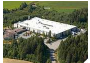
Ecocat head office and main production in Vihtavuori, Finland. 依柯卡特在芬兰的总部

With more than 20 subsidiaries world-wide, Dinex is headed towards a global position. The only significant geographical area uncovered, is South America, where production and sales are expected to start 2015, based on already established customer agreements.