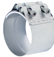
Dinex no. 99310