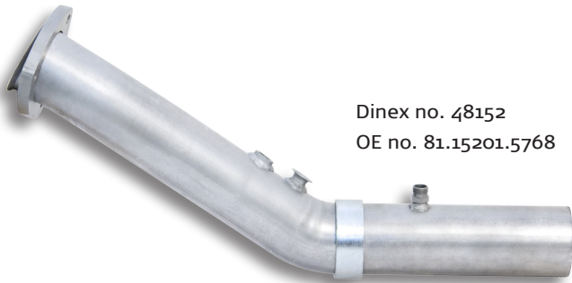
Dinex no. 48152 OE no. 81.15201.5768

Manufacturers part numbers are quoted for reference only | | Truck | Product news | 06.14 | 31 | Printed information is subject to change without prior notice. Please refer to www.dinex.dk for most recent data, or contact your local Dinex sales office.