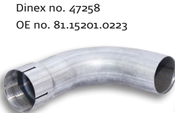
Dinex no. 47258 OE no. 81.15201.0223