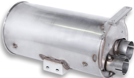
Dinex no. 47346 OE no. 81.15101.0437