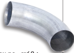
Dinex no. 47684 OE no. 81.15201.0222