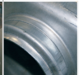
Dinex: Inlet without external welding