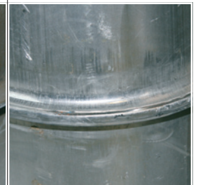
Dinex: Special pressing tools to close the silencer