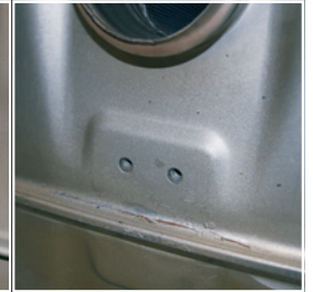
Dinex: Inside reinforcement to mount the tail pipe