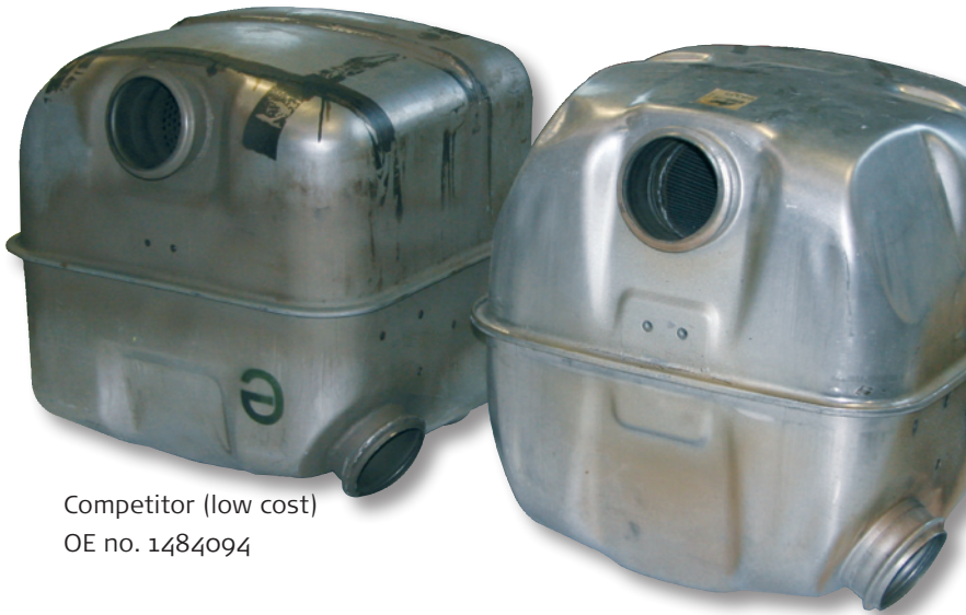
Competitor (low cost) OE no. 1484094