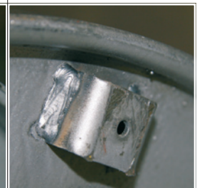
Dinex: Stronger brackets to the heat shield