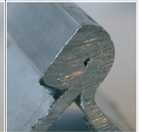
Dinex: Stronger closing of the lockseam

Dinex is pleased to inform that we have made a competitor comparison between Dinex and a Polish competitor on our well known silencer 80451 for Volvo FH12.