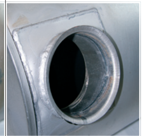
Dinex: Reinforcement around the inlet pipe