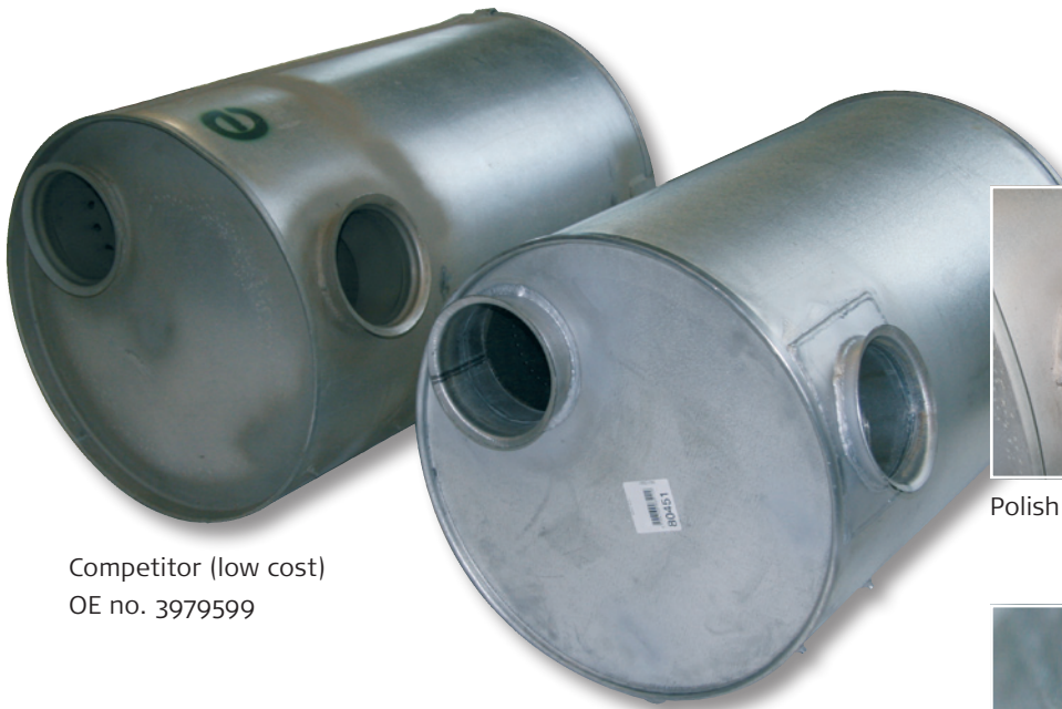
Competitor (low cost) OE no. 3979599