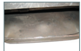
Non perforated inner baffles.