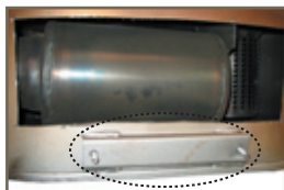
Internal silencer like OE. Bracket for mounting like OE.