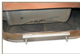
Perforated inner baffles with biosil.